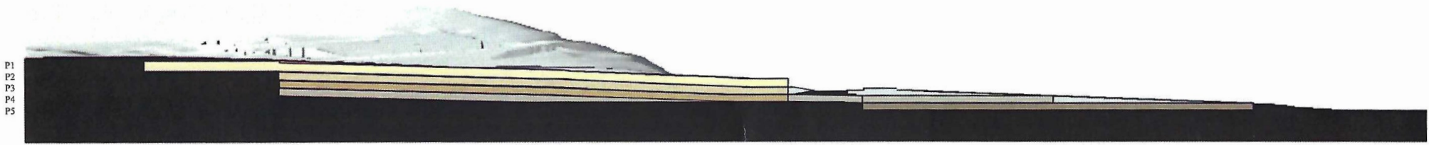
Section of parking structure levels P1-P5